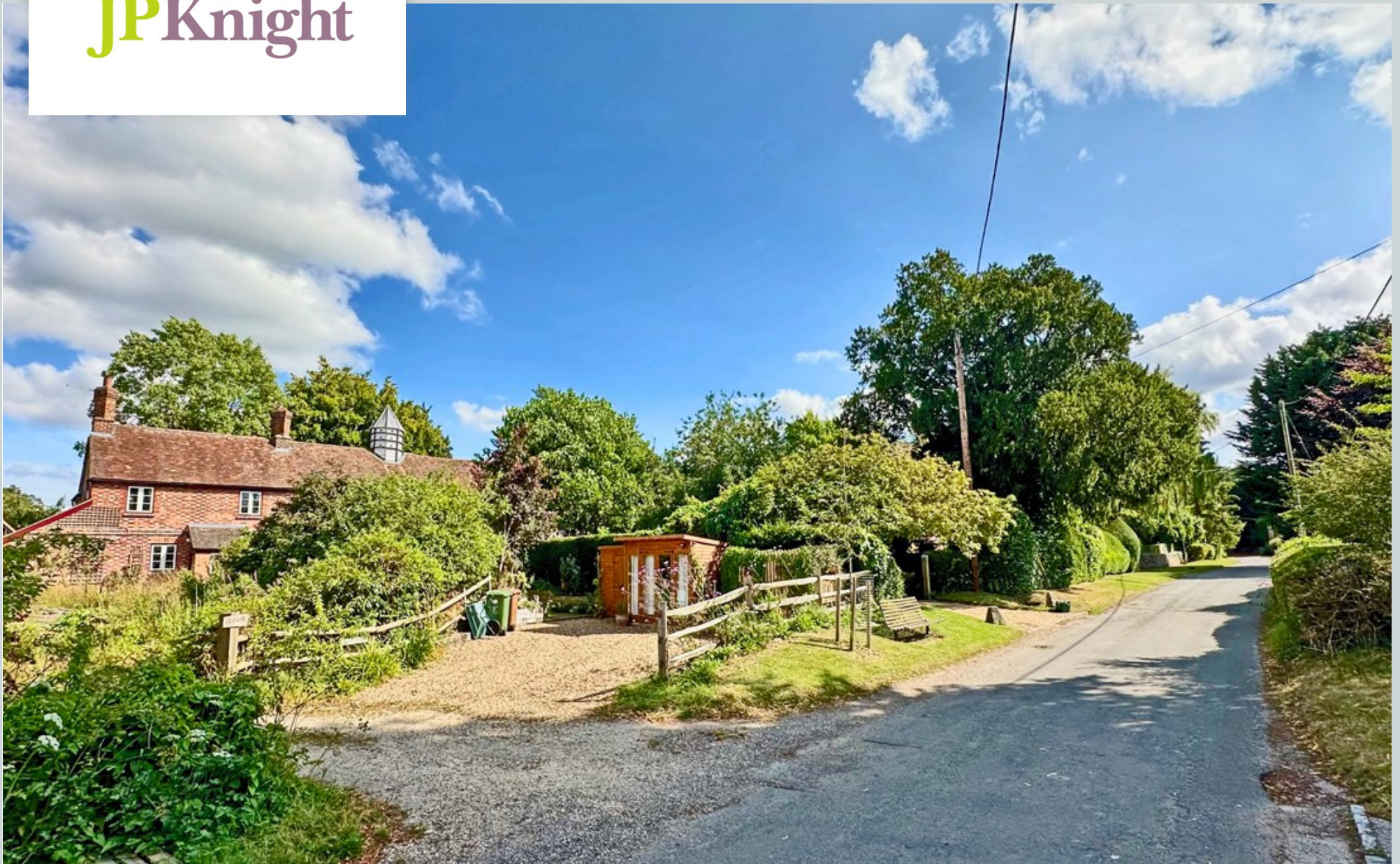
Knightsbridge Lane, Pyrton OX49 5AP