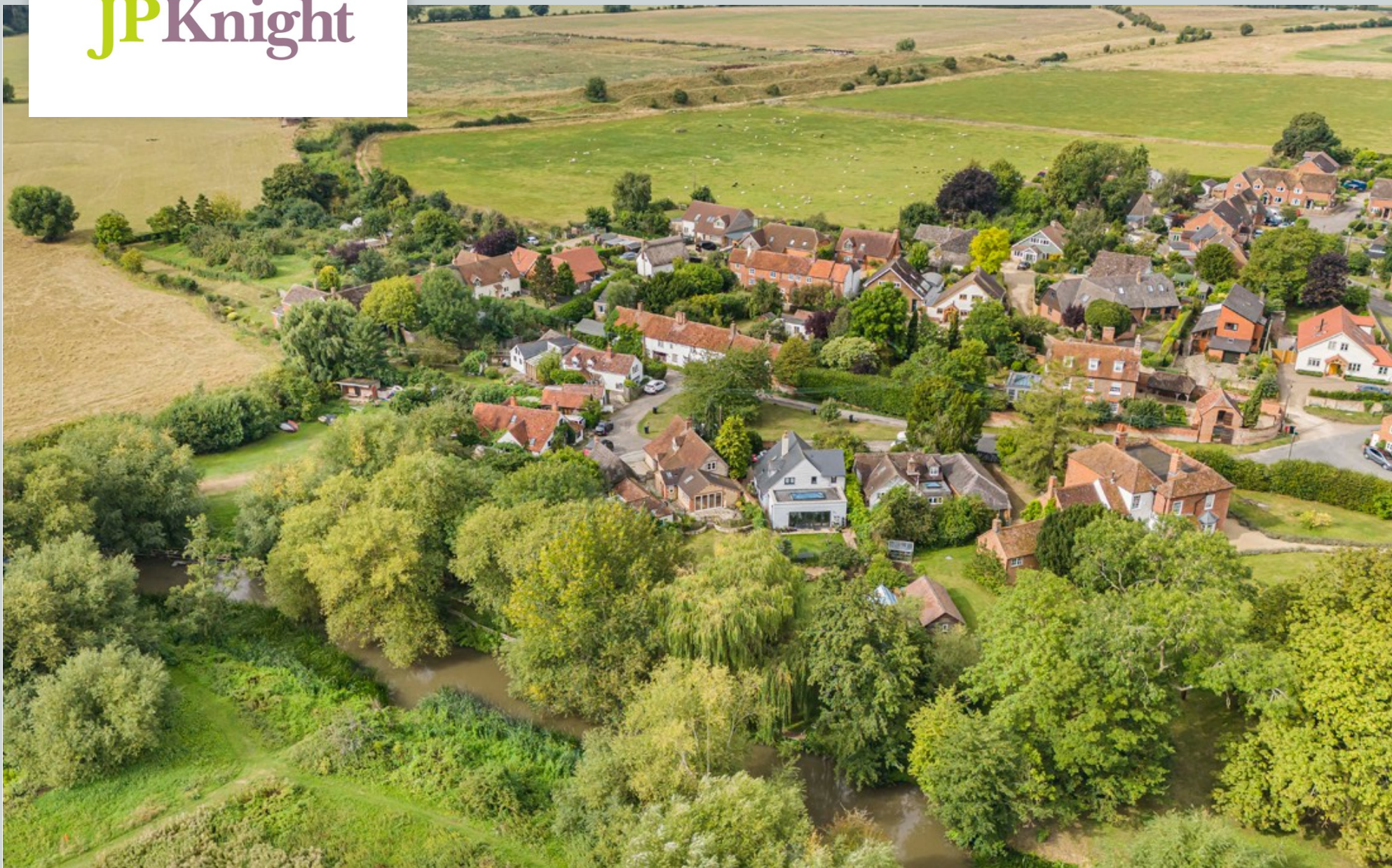
Bridge End, Dorchester on Thames OX10 7JR