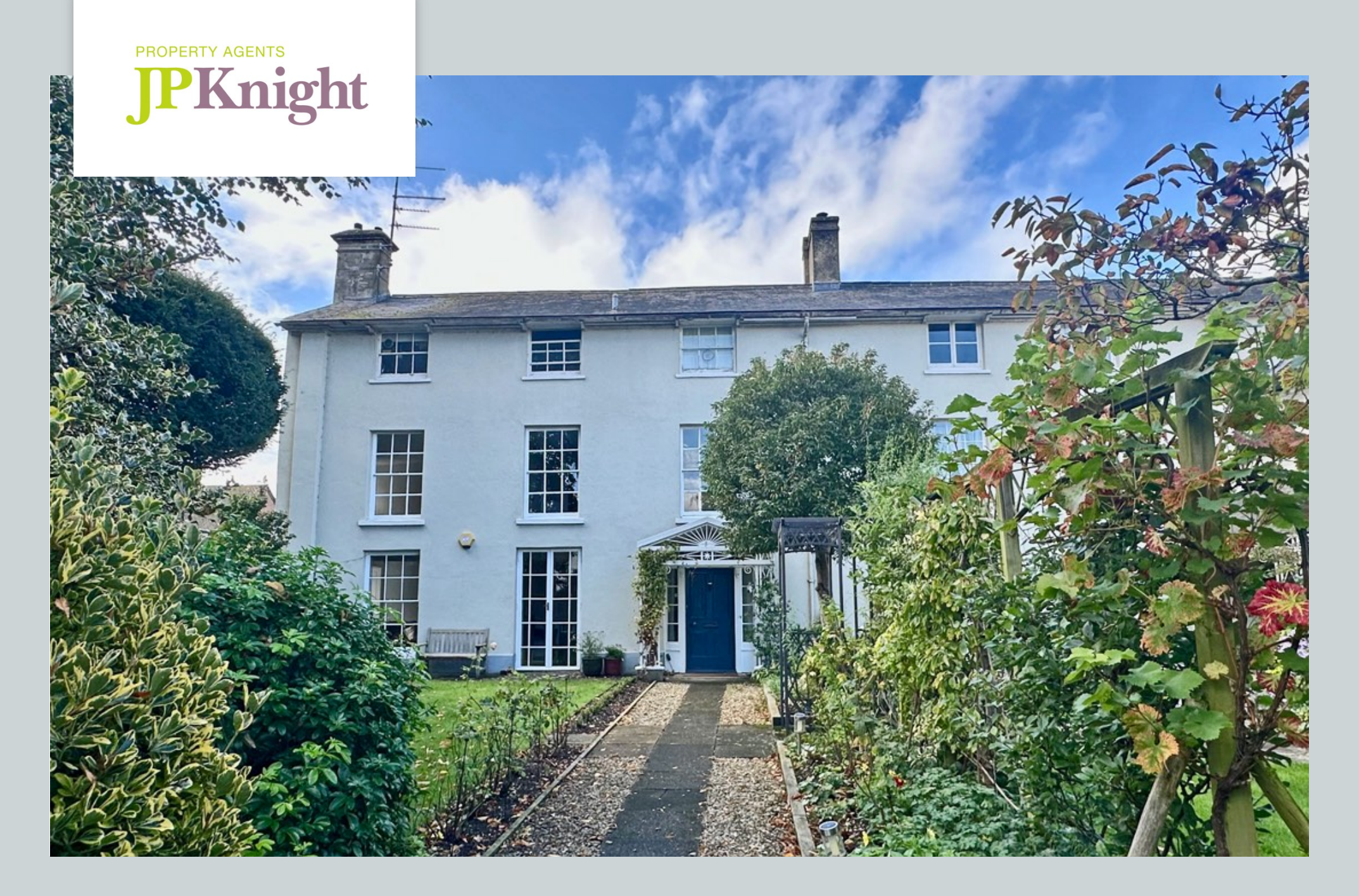
St Johns House, St Johns Road, Wallingford OX10 9AB