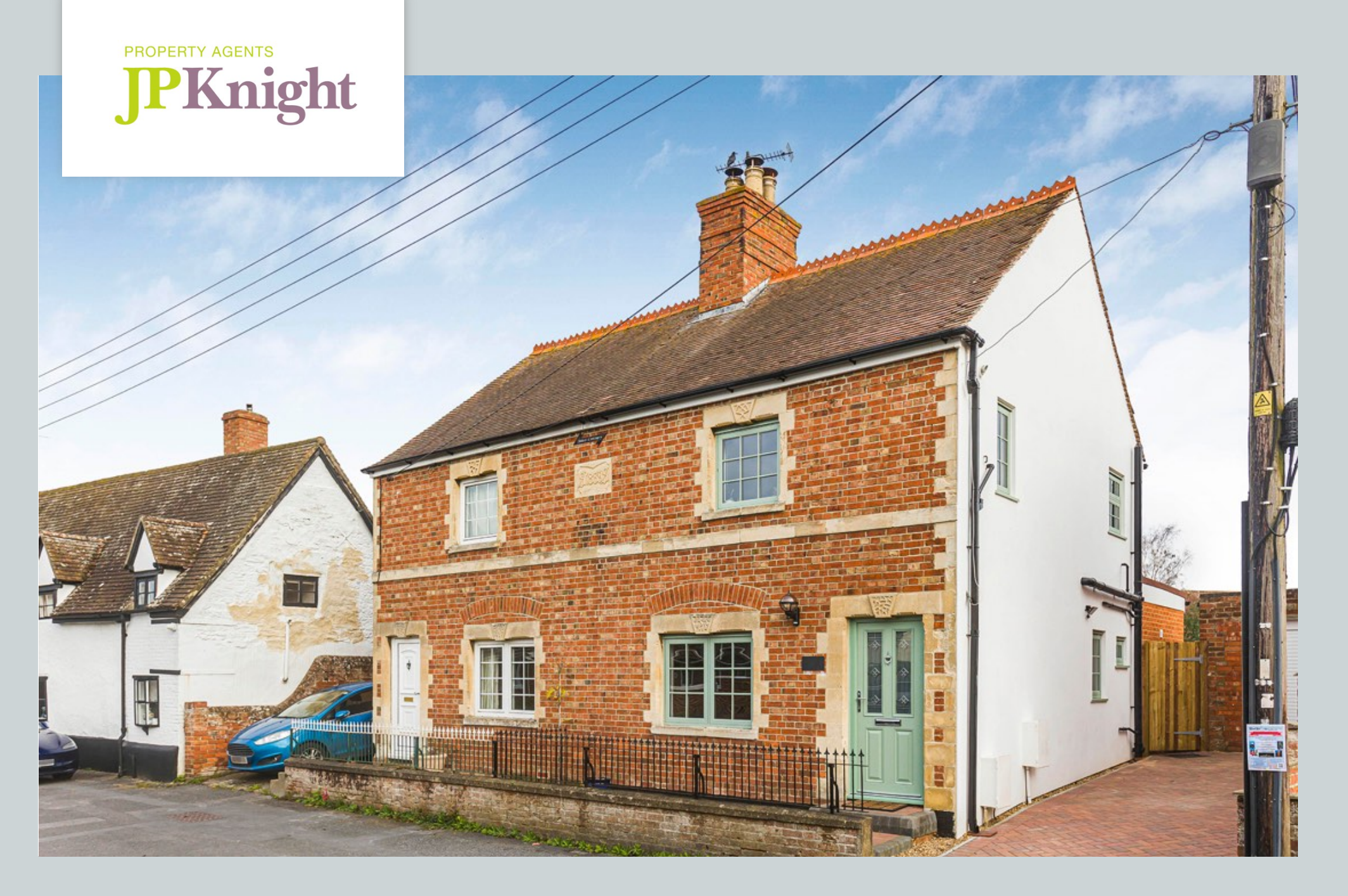
Queen Street, Dorchester-on-Thames, OX10 7HT