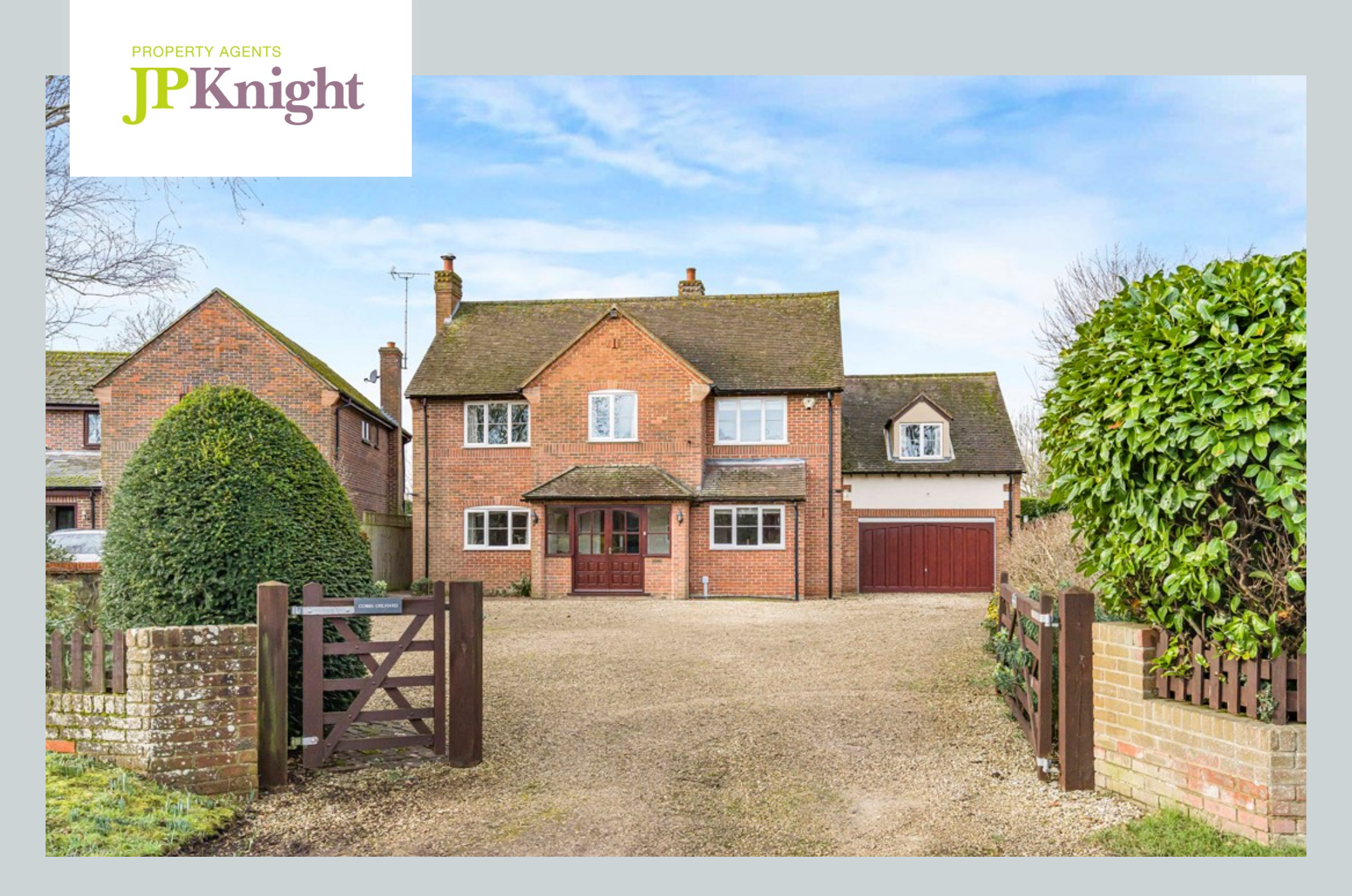
High Street, North Moreton, OX11 9AT