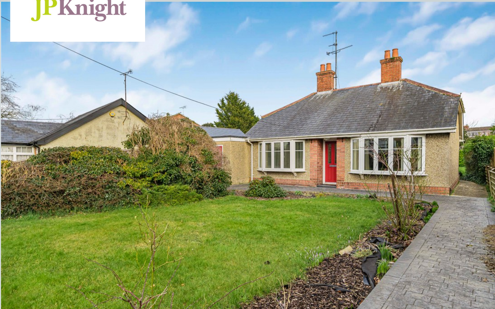
Honey Lane, Cholsey, OX10 9NL